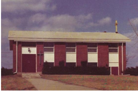
Original building, dedicated in 1958