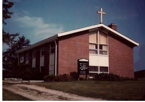
Before the addition of the current sanctuary