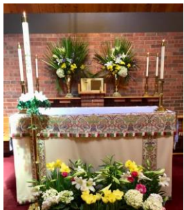
Our beautiful altar on Easter morning!