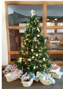
Advent Baby Baskets

Thank you to all who contributed to our eight Advent Baby Baskets! This is our third year of donating new baby items to moms in need.