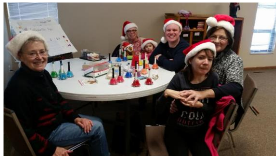
Music Therapy Christmas Party 2016

Thank you to all who contributed to our eight Advent Baby Baskets! This is our third year of donating new baby items to moms in need.